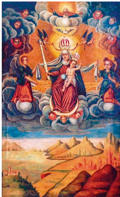
The miracle-working image of Our Lady Protector of the Human Ways

Conference for Polonia and Poles Abroad, as well as the Institute of Emigration Chaplaincy of the Priests of Christ in Poznań. In 2007, the Centre established patronage cooperation with the sanctuary in Sokołów Małopolski, where there is an image of Our Lady Protector of Human Ways.